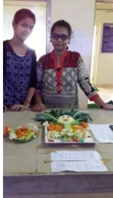
1 ST PRIZE WINNERS WITH THEIR CREATIONS