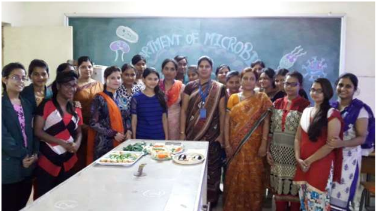
PARTICIPANTS WITH JUDGES AND TEACHERS