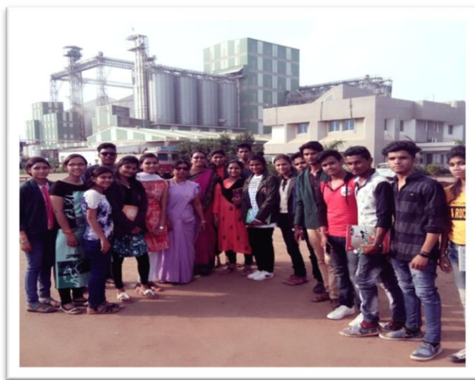
ABIES Industry, Rajnandgaon